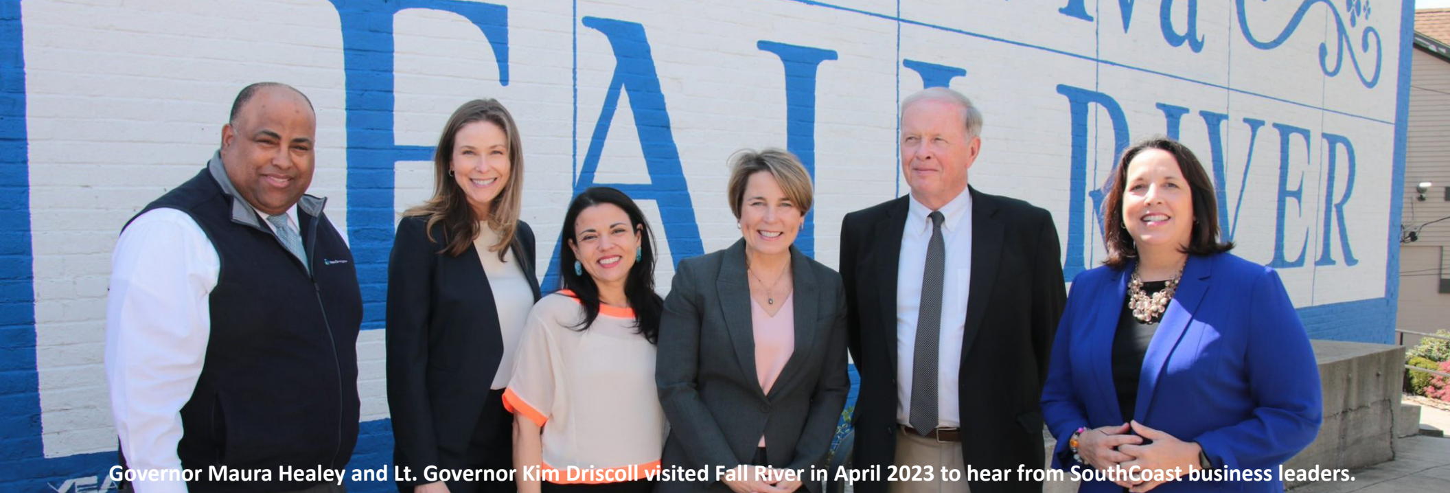
Governor Maura Healey and Lt. Governor Kim Driscoll visited Fall River in April 2023 to hear from SouthCoast business leaders.