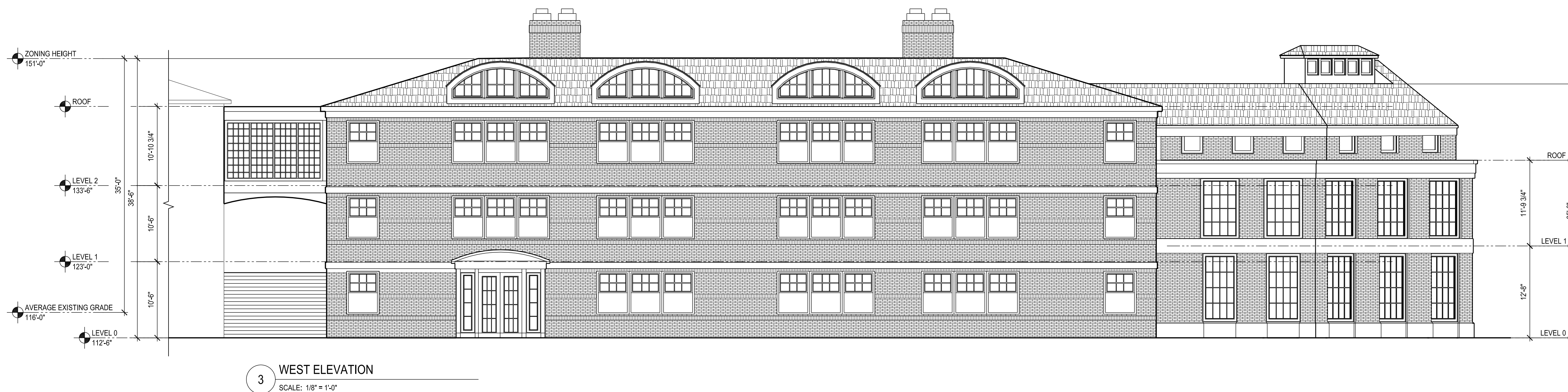
3 WEST ELEVATION SCALE: 1/8" = 1'-0"