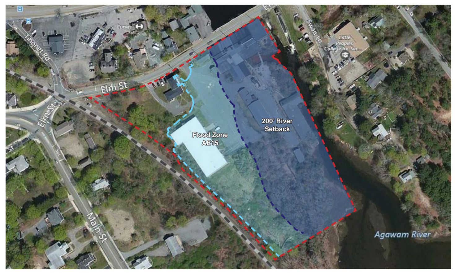
RIVERFRONT SETBACKS DIAGRAM