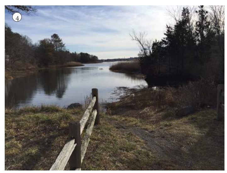
PUBLIC KAYAK LAUNCH