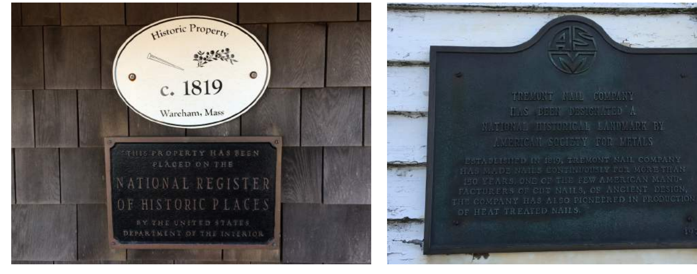
HISTORIC DESIGNATION PLAQUES ON SITE