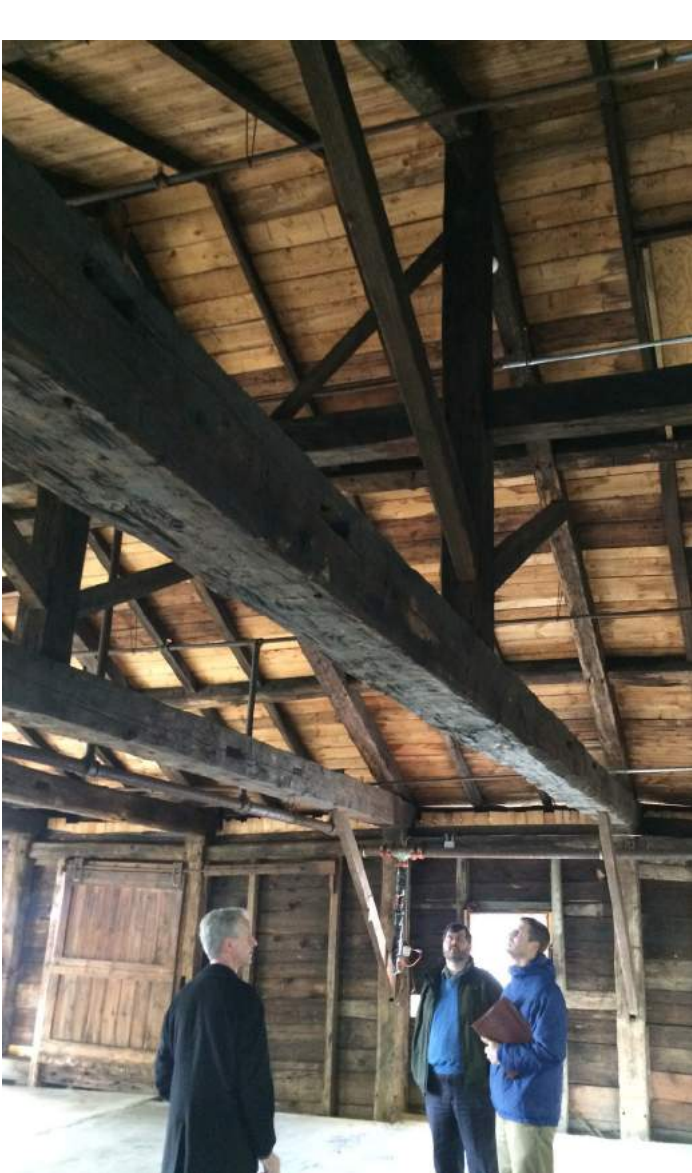
INTERIOR VIEW OF MAIN SPACE IN FREIGHT BUILDING