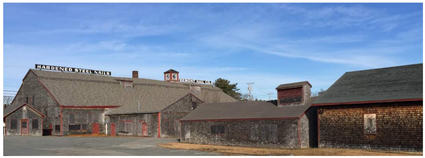
HISTORIC STRUCTURES WITH SHARED PALETTE OF MATERIALS, COLORS AND SCALE CREATE A CAMPUS-LIKE FEELING ON SITE

The Tremont Nail Factory site includes roughly 48,000 square feet of space in eight buildings on a 7.2 acre lot. The site was acquired by the Town of Wareham in 2004 with Community Preservation Act funds. A conditions assessment was done for the Town in 2009 by Menders, Torrey & Spencer. This study is available for public download and serves as the basis for the conditions listed in following pages. The site is listed on the National Register of Historic Places and was designated a National Historical Landmark by the American Society of Metals.