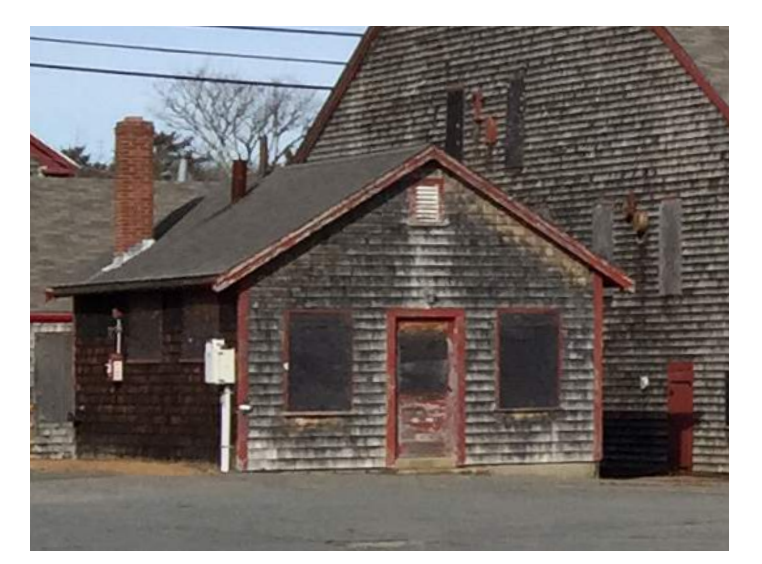
EXTERIOR VIEW OF RESTROOM BUILDING

Taken separately, none of these buildings is particularly remarkable, but as a collection amongst the original three, they help complete the overall campus.