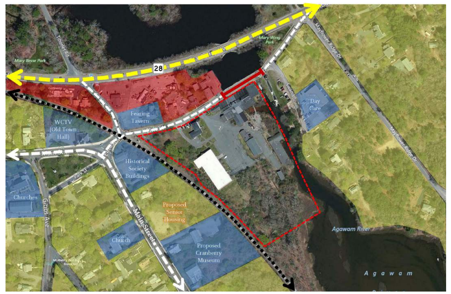
The immediate context includes a mix of uses. A number of retail uses (shown in red) can be found north of the site on Route 28 and Elm Street. There are also a number of civic uses close by (shown in blue), typically in historic structures along Main Street. The balance of the local context is residential (shown in yellow).