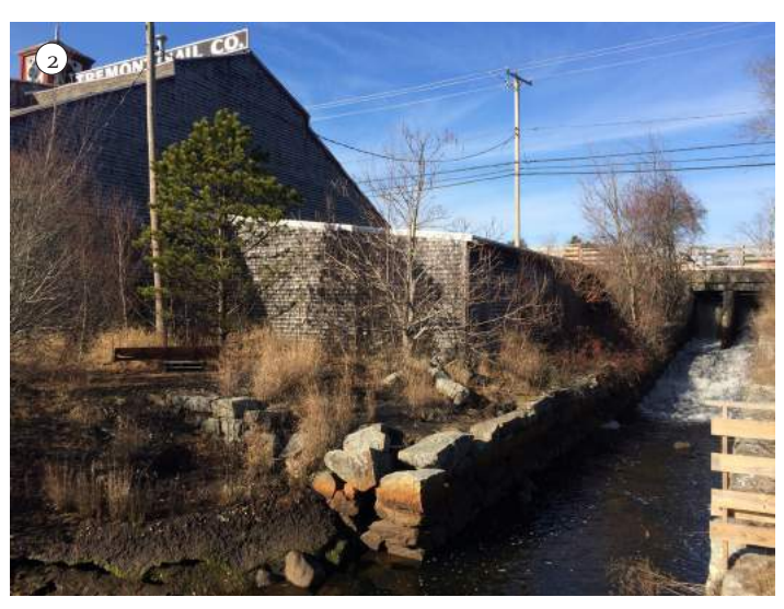
FISH LADDER AND FLUME ADJACENT TO SITE