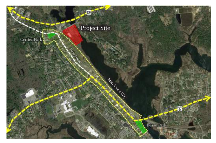
The "core" of Wareham (shown in yellow) can be defined as running the length of Main Street from Besse Park to the south up to Central Park to the north. Merchant's Way comprises the southern anchor of this stretch. If it were to be revitalized, the Tremont Nail Factory has the potential to help anchor the northern end.