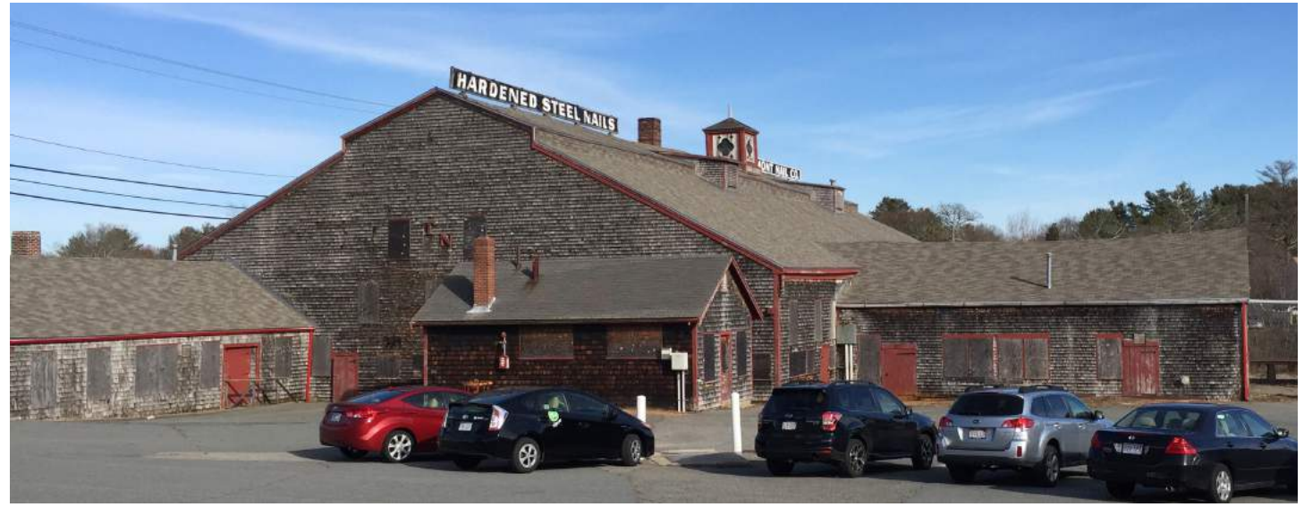
EXTERIOR VIEW OF FACTORY BUILDING SHOWING MAIN CENTRAL VOLUME AND ADDITIONS, OR ELLS, ADDED OVER TIME