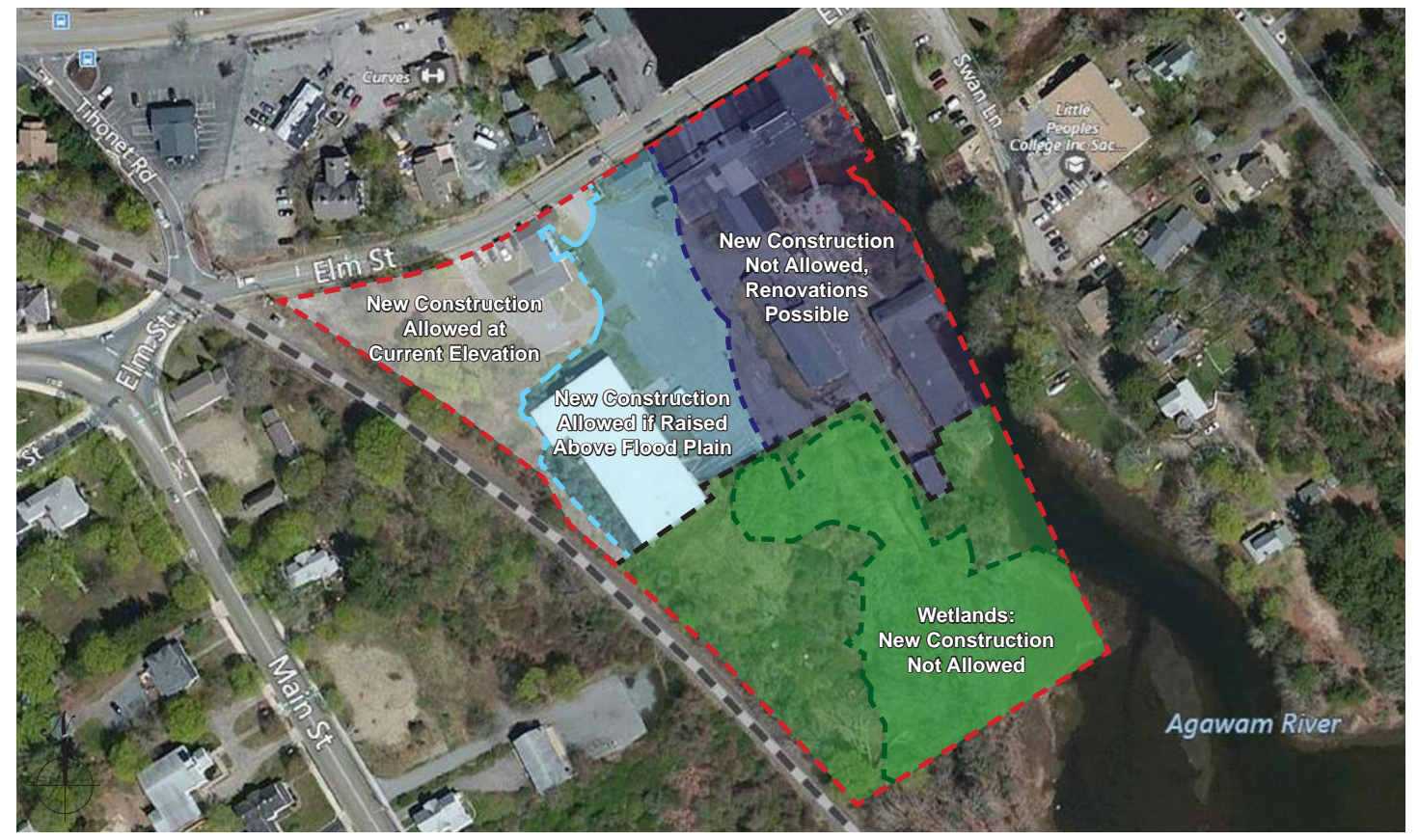
DEVELOPMENT OPPORTUNITY DIAGRAM

Summary : The below diagram shows the resulting development opportunity on site. The northwest corner is out of these regulated zones and is available for new construction, the middle zone is available for new construction if built above the flood elevation, the historic buildings in the northeast corner are eligible for renovation (but not new construction), and the lower third of the site will be preserved as wetlands with the potential for native restoration and/or a passive recreation walk.