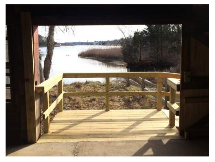
VIEW FROM MAIN SPACE TOWARDS MERCHANT'S WAY