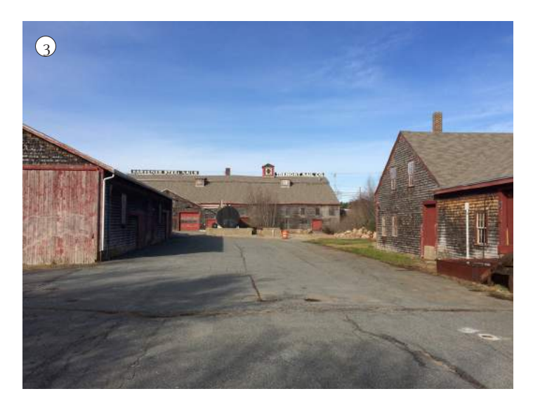
THE "YARD" - SPACE BETWEEN THE HISTORIC STRUCTURES