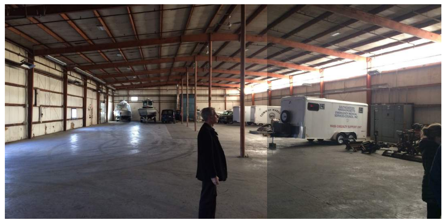
INTERIOR VIEW OF STEEL BUILDING SHOWING CURRENT USE AS TOWN STORAGE