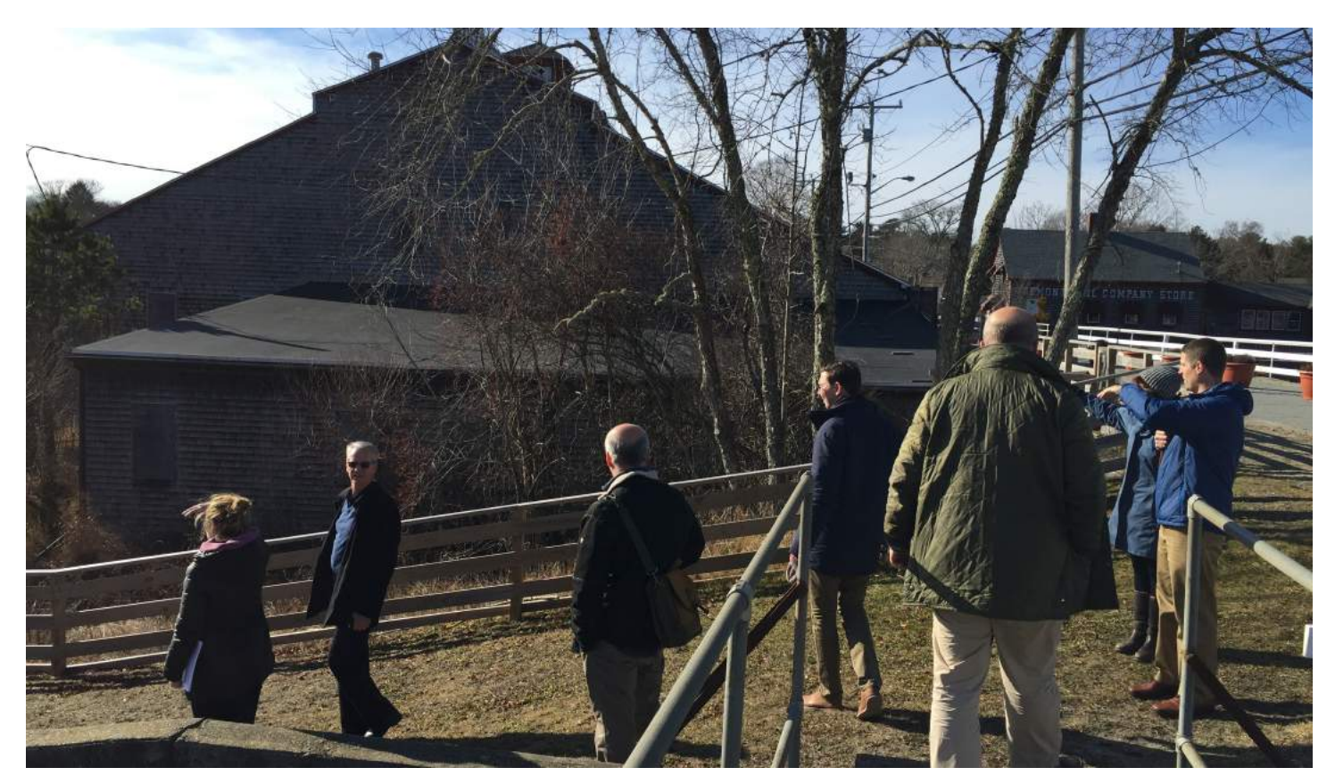
PROJECT TEAM VISITING THE SITE IN JANUARY

The process has culminated with this Final Report that summarizes the efforts to date and describes the final vision plan and recommendations, including next steps.