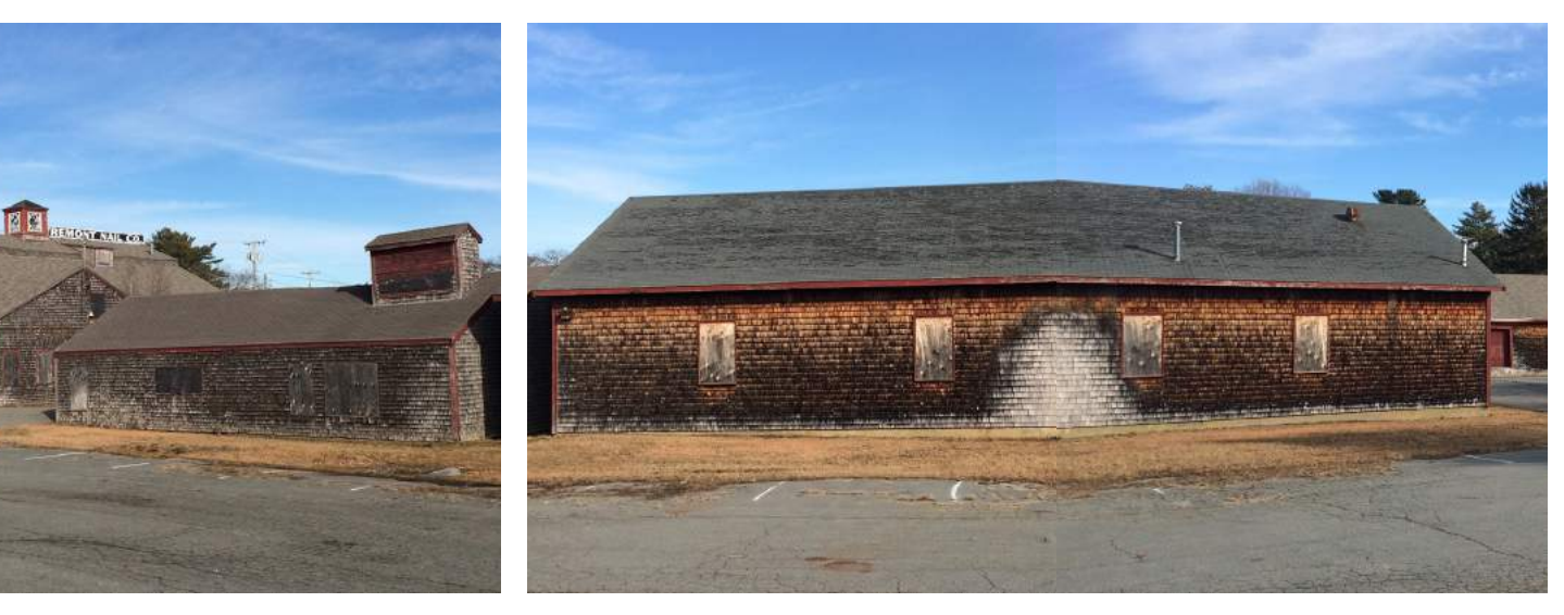
EXTERIOR VIEW OF PICKLING BUILDING