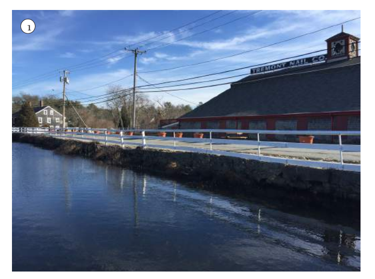
PARKERS MILL DAM, CURRENTLY CLOSED TO VEHICULAR USE

In addition to the buildings on site, there are a number of key site features worth consideration. Parkers Mill Dam (1) runs just north of the property but is currently closed to vehicular use due to its poor condition. Immediately east of the site are a flume and fish ladder (2) that provide a great vantage point looking towards the site and river. The "yard" (3) is an outdoor space nicely contained by the historic structures. The site also currently includes a public kayak launch (4), a great amenity that has limited use at low tide due to the shallow mud banks.