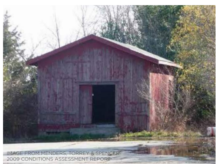
EXTERIOR VIEW OF FREIGHT SHED